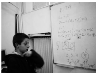
Figure 4. In “Robot” language

Vessela: Ah, it means we have to present 1 as 4^0